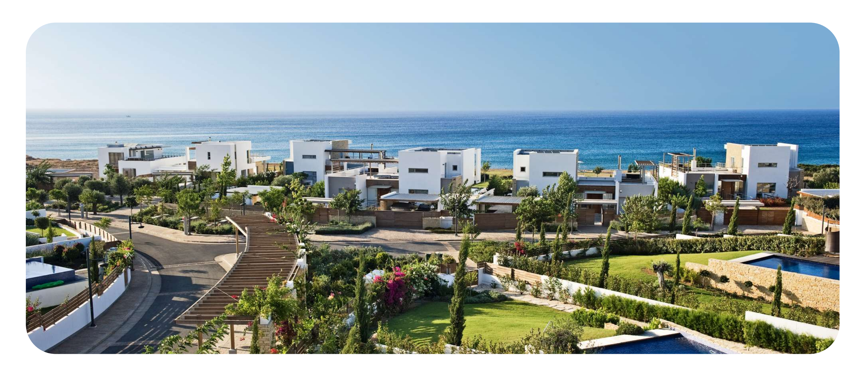
Premium villas by the sea in the most picturesque place in Cyprus, next to the Akamas Peninsula