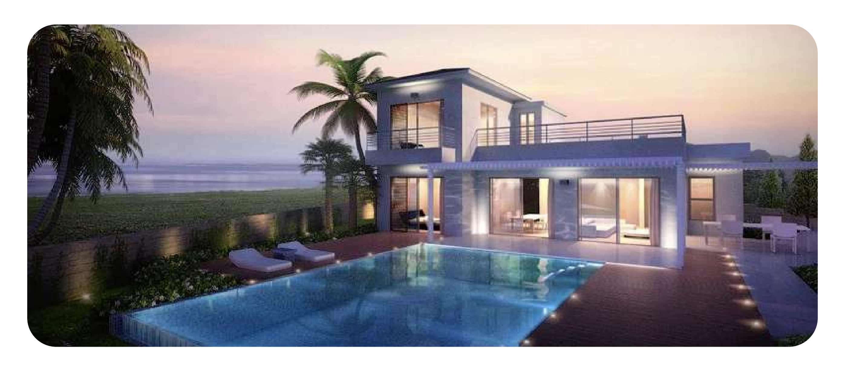
Exclusive villas 150 meters from the beach with panoramic views of the natural beauty of Polis