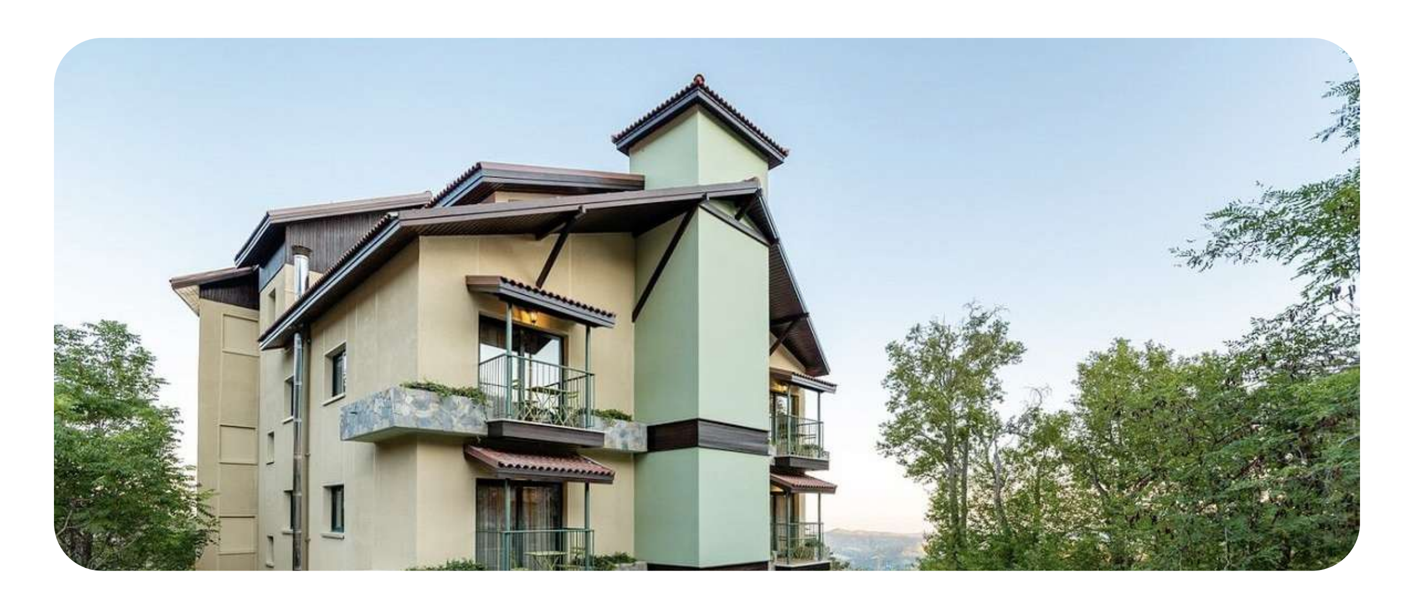
Modern boutique hotel with 32 rooms in the Troodos mountains