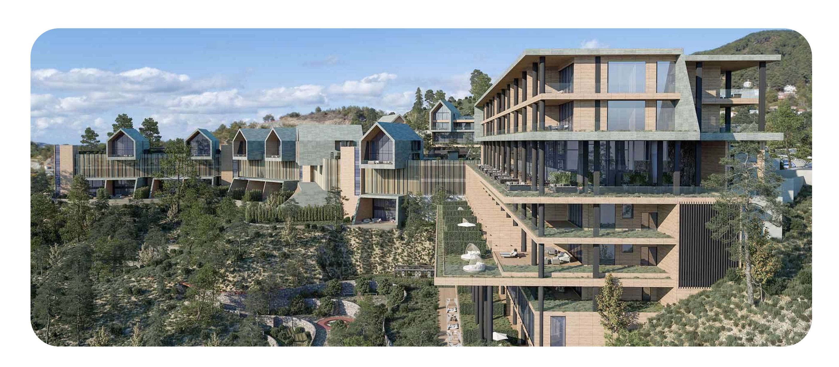
Apartments, villas and townhouses with magic views at an altitude of 1065 meters above sea level